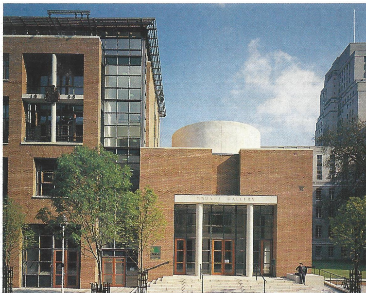
Studios contextualty in Bloomsbury, by Nicholas Hare Architects, p68