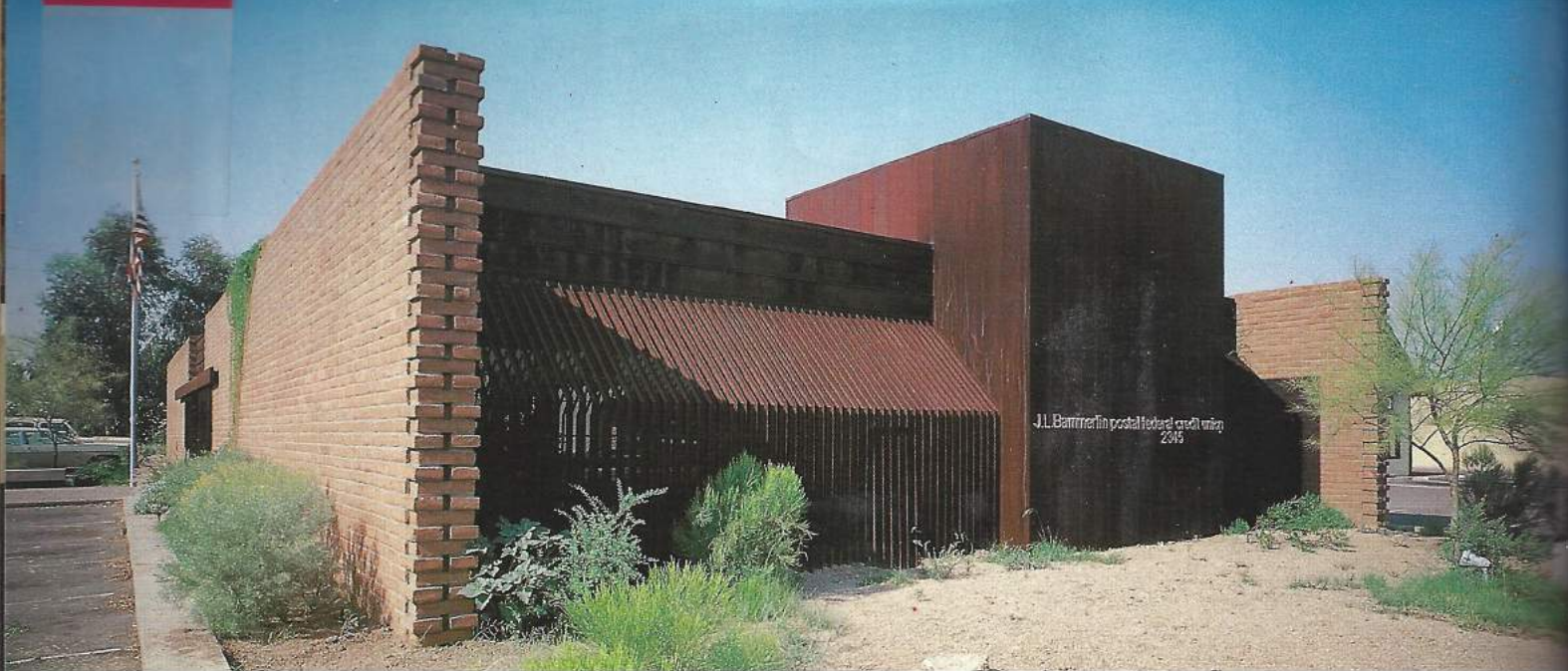
Natural materials and modern technology combine to create sculptural expressions in a functional structure at peace with its environment.